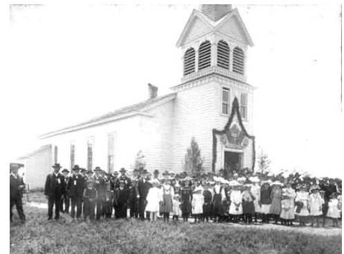
St. Kilian's Church at time of diamond jubilee.