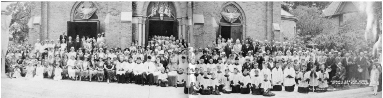
Some of the attendees at and participants in the Wisconsin Catholic Central Verein and Catholic Women's League of Wisconsin convention held in Burlington June 21-23, 1931, are shown in front of St. Mary's church after Sunday Mass.

Tuesday, the last day of the convention, opened with a requiem Mass at St. Charles for departed members of the Central Verein and the Catholic Women's League of Wisconsin. A business session followed, at which reports of the legislative and resolutions committees were heard and officers were elected. In the afternoon the delegates were entertained with an automobile tour of the region's lakes. The route took the sightseers, in thirty-eight cars, past Brown's Lake and the Franciscan Monastery, to Elkhorn where a stop was made at the Holton musical instrument factory, through the lake region of Delavan, then to Lake Geneva, and back to Burlington. In the evening, the closing banquet with a program of speeches and music was held at St. Charles hall.