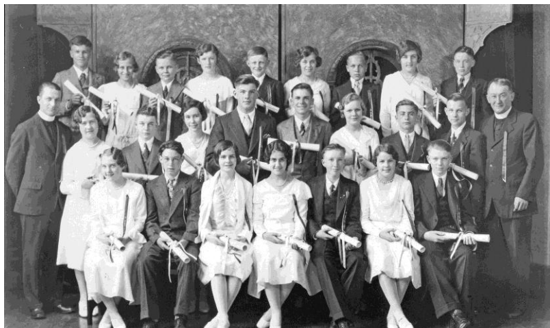
ST. CHARLES – CLASS OF 1931